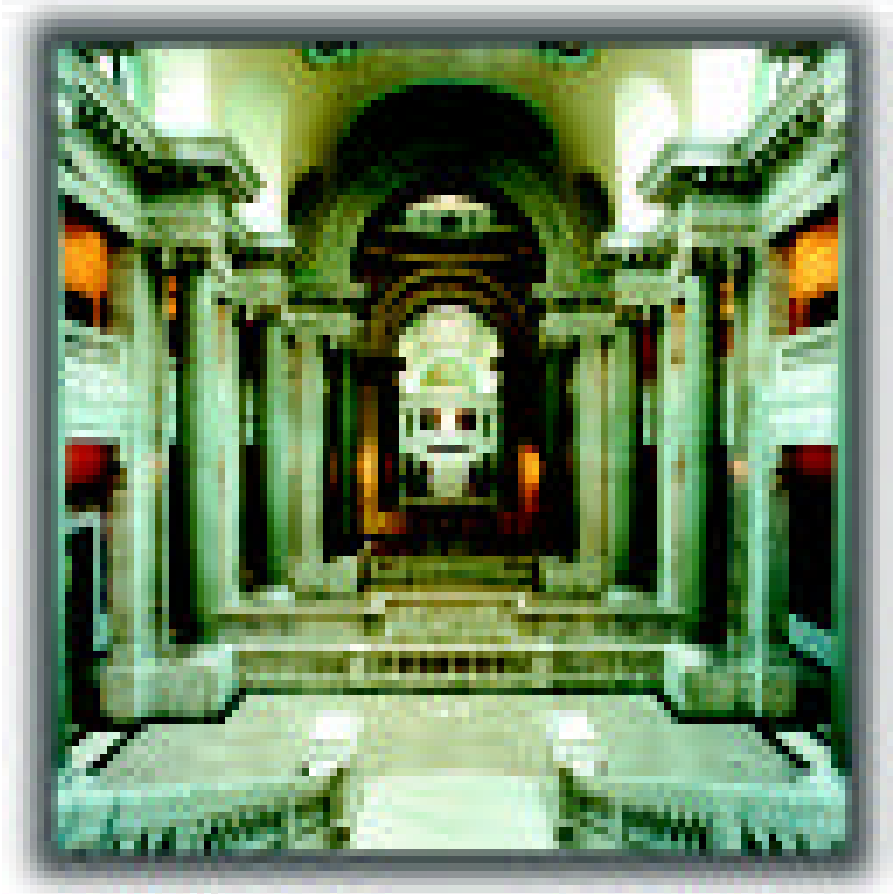
The Capitol-view from the House of Representatives.

n 2000, the Department was successful in having legislation (Senate Bill 169) enacted into law that should provide the state's banks greater flexibility and reduce administrative compliance costs while the Department retains sufficient oversight capability. Among other things, Senate Bill 169 amended KRS Chapter 287 to provide state banks with CAMEL ratings of 1 or 2 the authority to engage in any banking activity that the bank could engage in if it were operating as a national bank or operating as certain designated financial institutions in any other state. In addition, Senate Bill 169 gives banks,