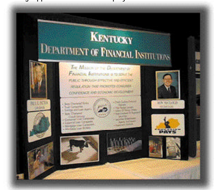
DFI display at Governor's Diversity Day (job fair), November 18, 2000.

A primary agency goal is to hire, train, and maintain a highly informed and capable staff. One of the ways the Department seeks to accomplish this goal is through staff development by identifying training needs, developing and delivering agency-specific training, coordinating and/or sharing training and education resources with other state and federal agencies, and assuring equal access to continuing education and training opportunities for all employees.